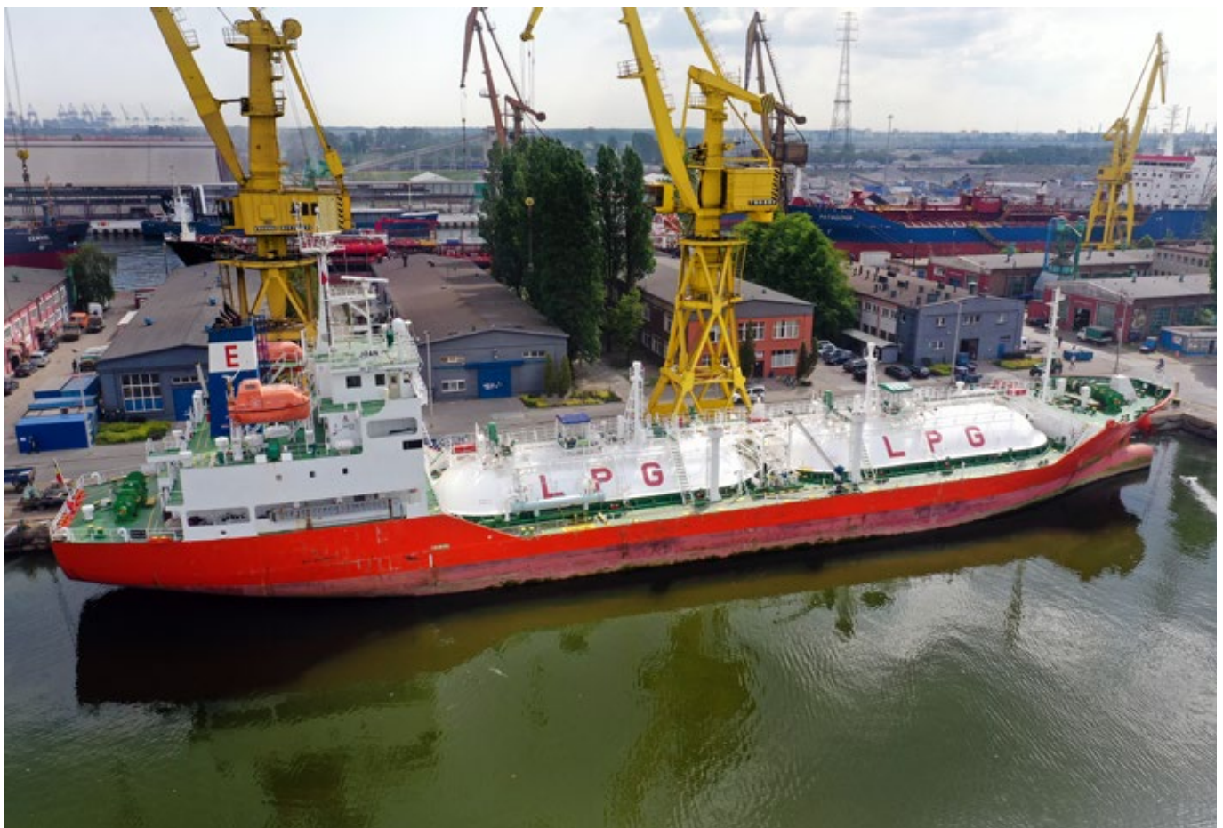
The Joan has been another Exmar owned LPG tanker hosted at Remontowa over the recent years

When the ship was in dry dock, our teams inspected the overboard valves and took measurements of the rudder blade. After being washed, the hull was painted. Chain lockers were water jetting and painted as well. The entire repair project was completed with minor steelwork in various areas on the ship.